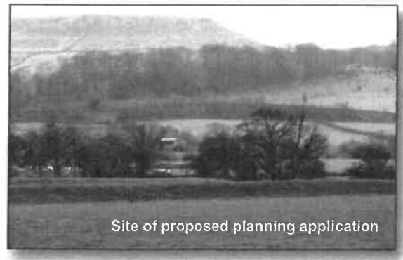
Site of proposed planning application

The Public Inquiry will be held at Chapel Town Hall and will commence at 10am on Tuesday 5 April 2016 and is expected to last four days.