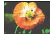
Poppy with flies