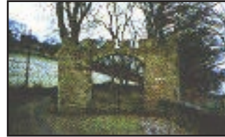
Eccles House gates

The walk commences in the Market Place by the Post Office. Go towards the church and just before the church gates on the left is a narrow road called Church Lane.