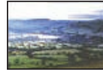
Combs Reservoir, Ladder Hill

The walk starts from the Market Place in Chapel-en-le-Frith which can be reached by train and bus from both Stockport and Buxton. By car on the A6 road turning off the bypass into Chapel.