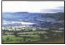
Combs Reservoir, Ladder Hill

The walk starts from the Market Place in Chapel-en-le-Frith which can be reached by train and bus from both Stockport and Buxton. By car on the A6 road turning off the bypass into Chapel.