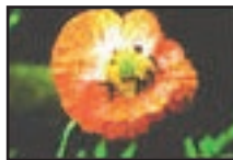
Poppy with flies