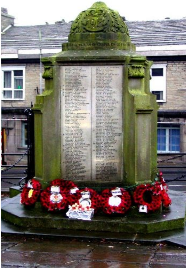
The Memorial in 2010 prior to the restoration works.

The restoration Work included re-pointing the Memorial and steps and the repair to this side which had been broken off in the past and repaired badly.