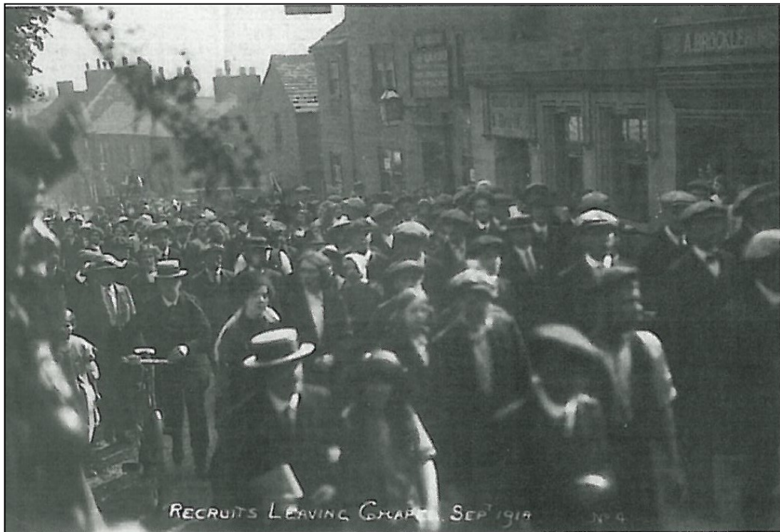
Recruits leaving Chapel September 1914