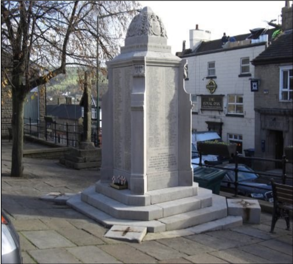
The Memorial was cleaned for Remembrance Day 2010.