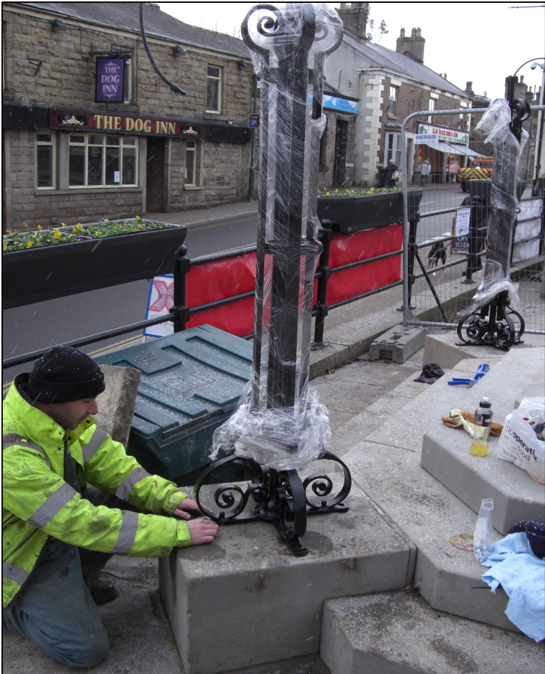
Restored wrought iron columns returned to the Market Place.