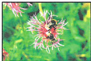
Bees - flower